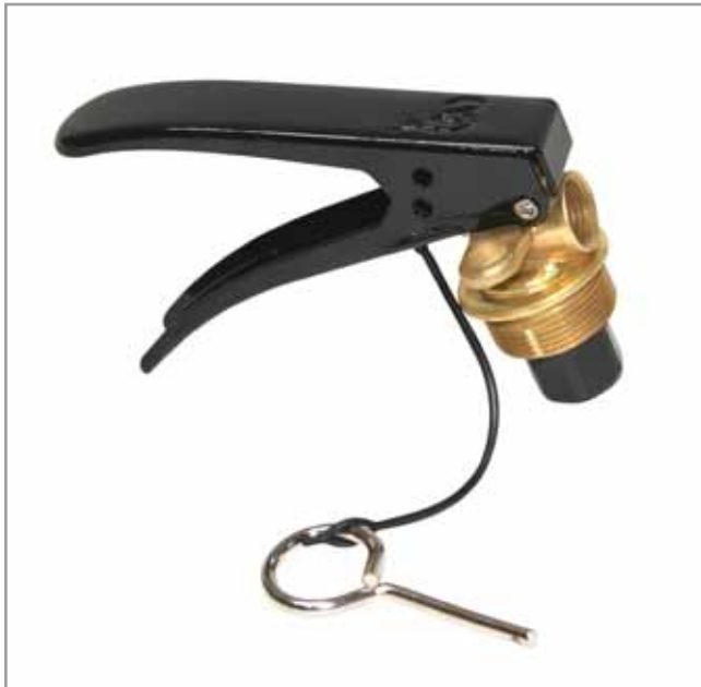
Válvula 30 mm