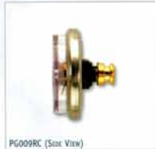
PG009RC (Side View)