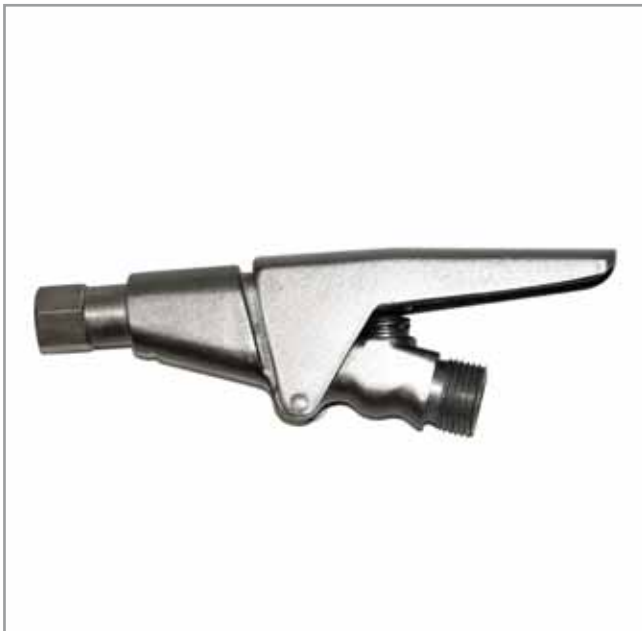
Boquilla Extintor Petrolero