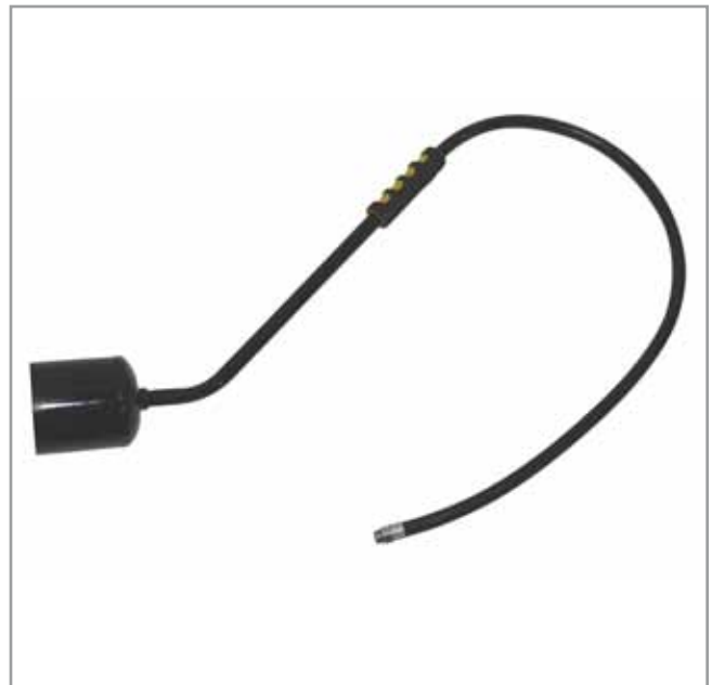
Manguera Extintor Tipo D