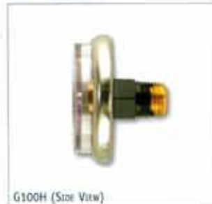
G100H (Side View)