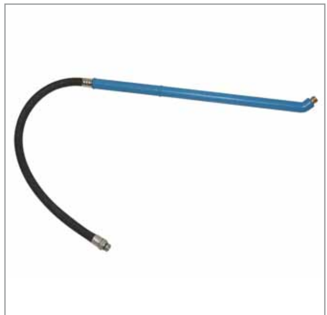
Manguera Water Mist o Agua Pulverizada