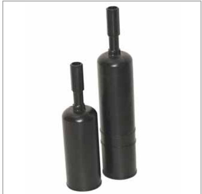
Cornetas de CO2