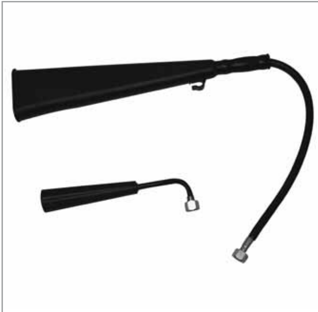
Cornetas CO2 Asiáticos