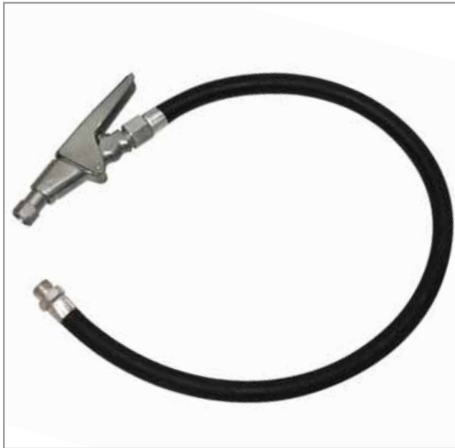
Manguera Extintor Petrolero