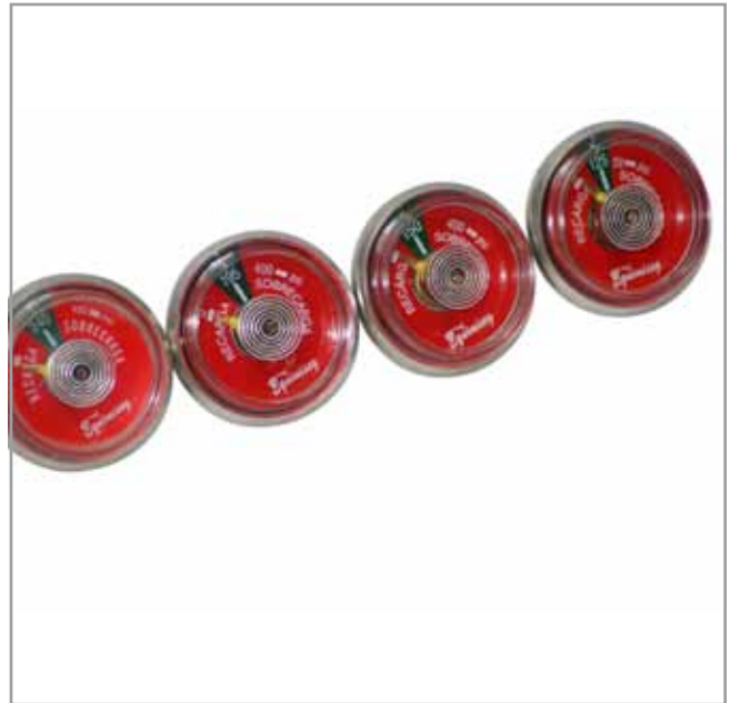
Manómetros para Extintor Portátil