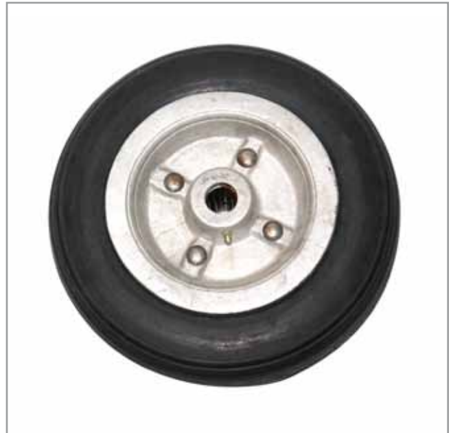
Rueda Extintor de 150 Lb