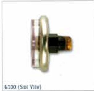
G100 (Side View)