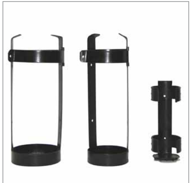
Soportes de Vehiculo