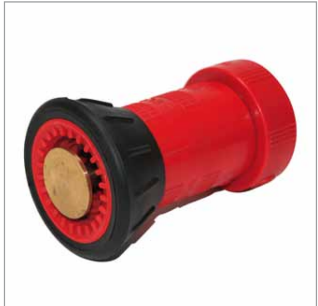
Boquilla de 1.5 en Policarbonato