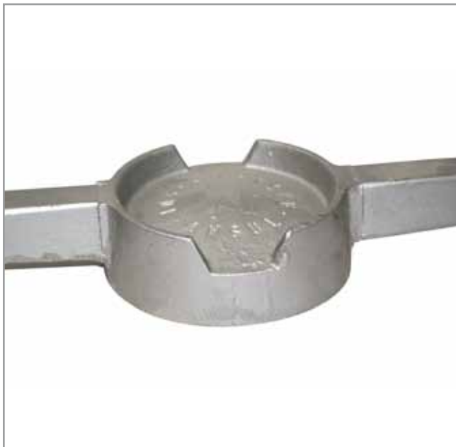
Tapa Extintor Carretilla