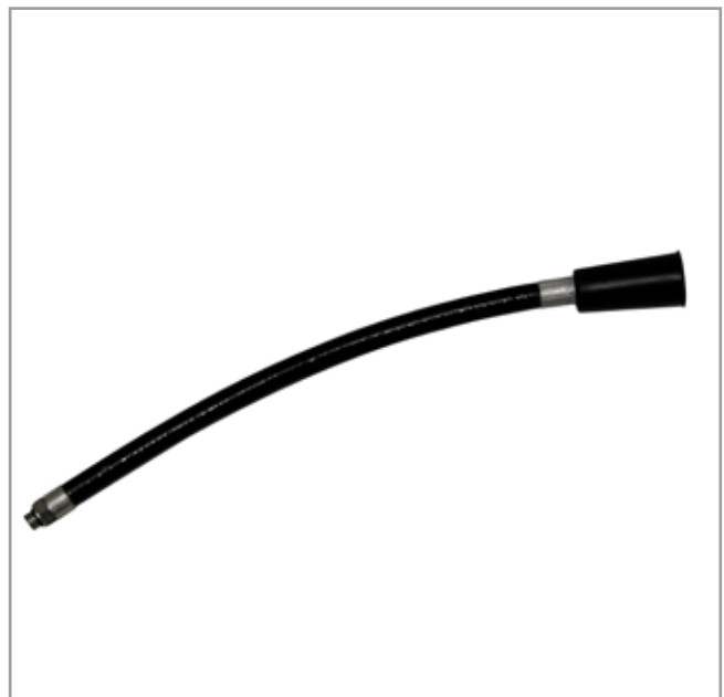
Manguera Extintor Agente Limpio