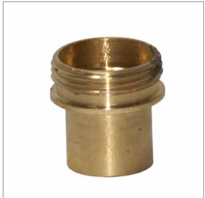
Porta Tubos en Bronce