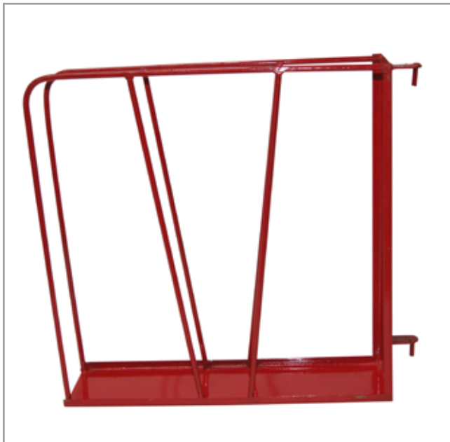
Soporte Canastilla para Manguera