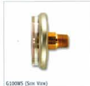
G100WS (Side View)