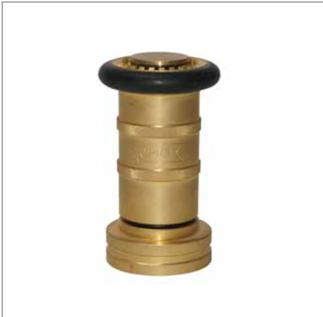
Boquilla de 1.5 en Bronce