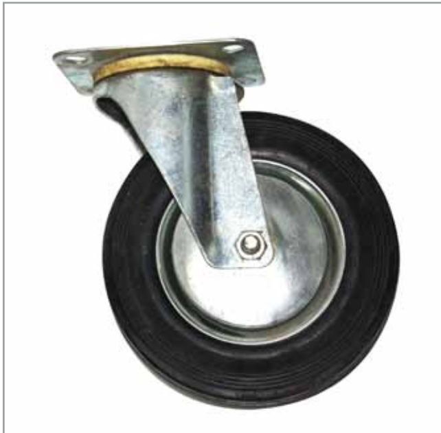
Rueda Giratoria Extintor 150 Lb