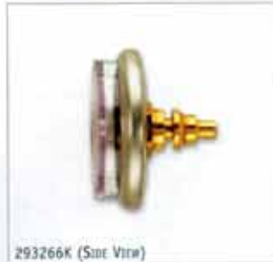
293266K (Side View)