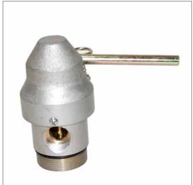
Válvula Extintor 150 Presurizado