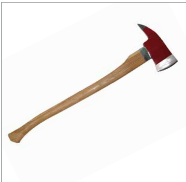
Hacha Pico 4.5 Lb