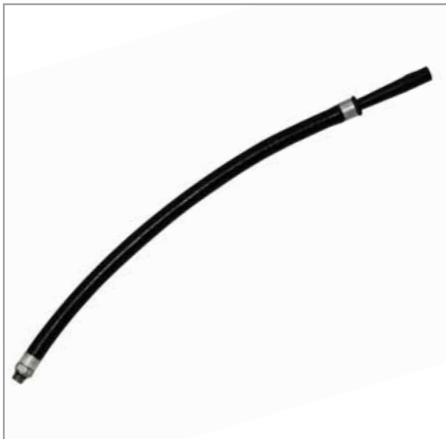
Manguera Extintor Polvo Químico