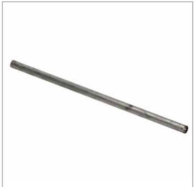
Tubo Sifón Aluminio