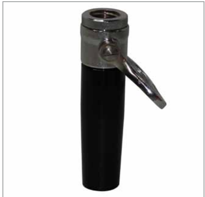
Boquilla Extintor de 150 Americano