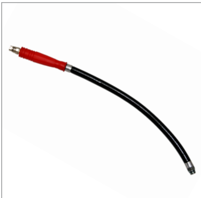
Manguera Extintor Tipo K